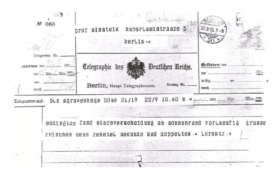
Figure 3. Telegram, now in possession of Museum Boerhaave, Leiden. Reproduced with permission.