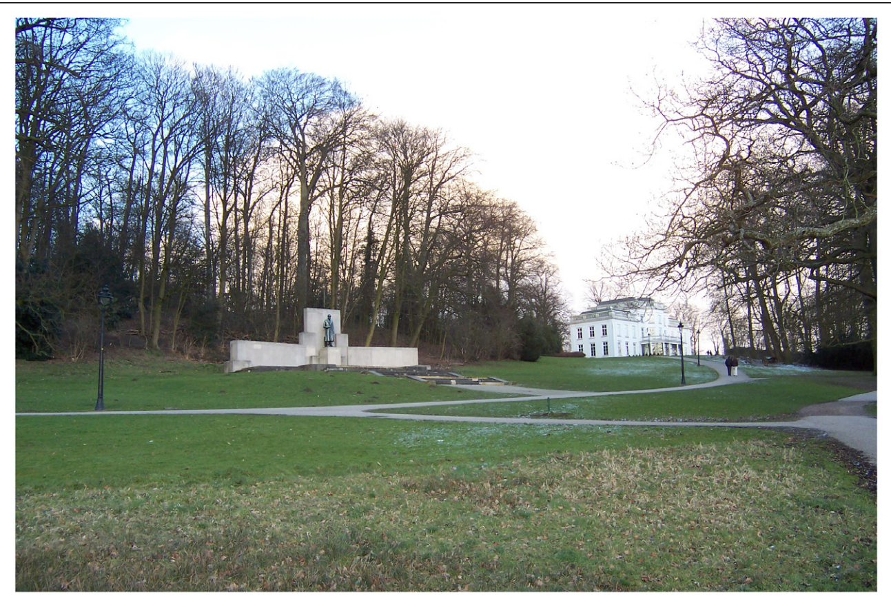
Figure 5. Lorentz monument in Arnhem. (This figure is in colour only in the electronic version)