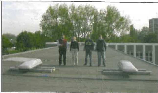
▲ Fig. 3: Typical arrangement of the detector on the roof of a school.